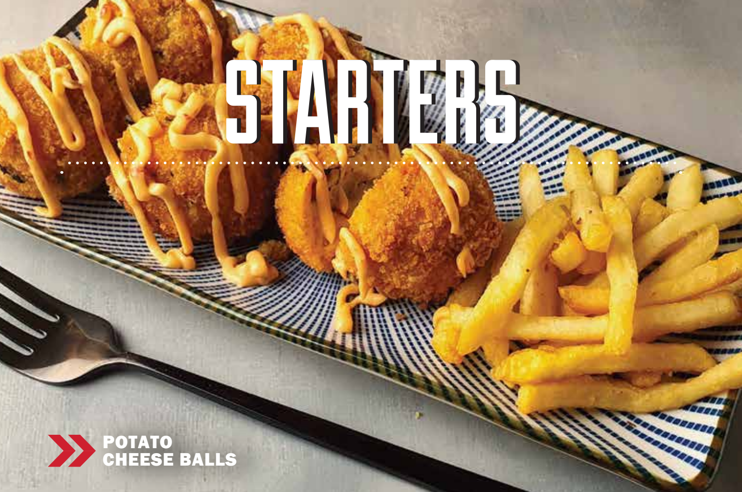
POTATO CHEESE BALLS