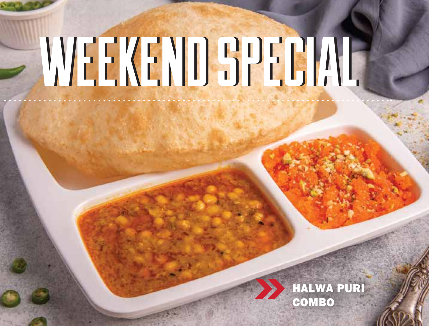
HALWA PURI COMBO