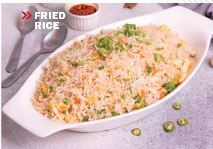
» FRIED RICE