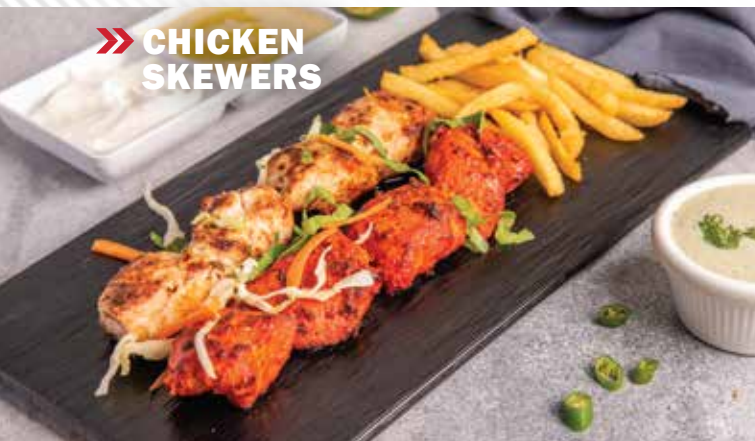
» CHICKEN SKEWERS