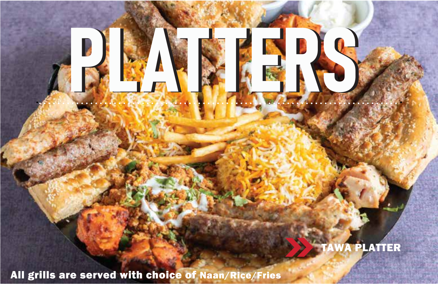
» TAWA PLATTER

All grills are served with choice of Naan/Rice/Fries