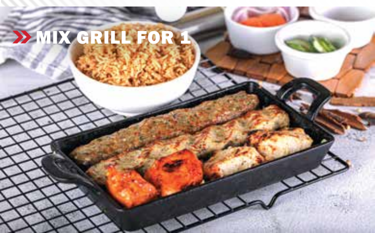
» MIX GRILL FOR 1