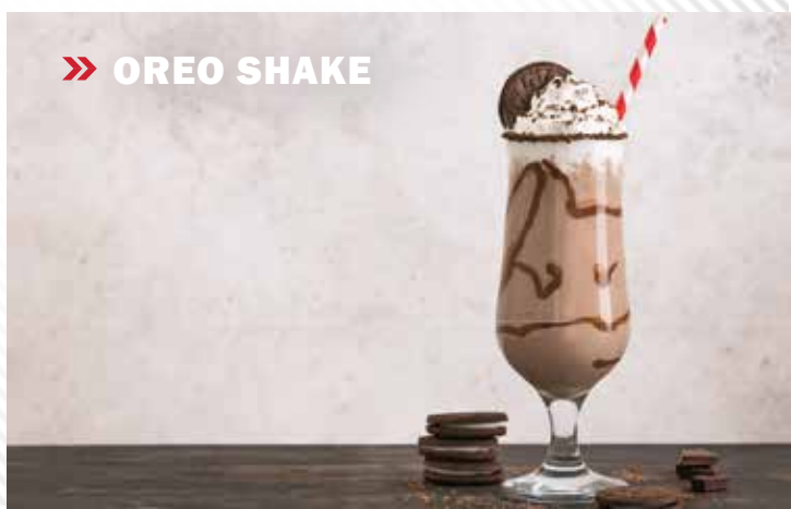
» OREO SHAKE