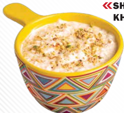
« SHEER KHURMA

Sweet milk dough balls soaked in a sweet sugar syrup