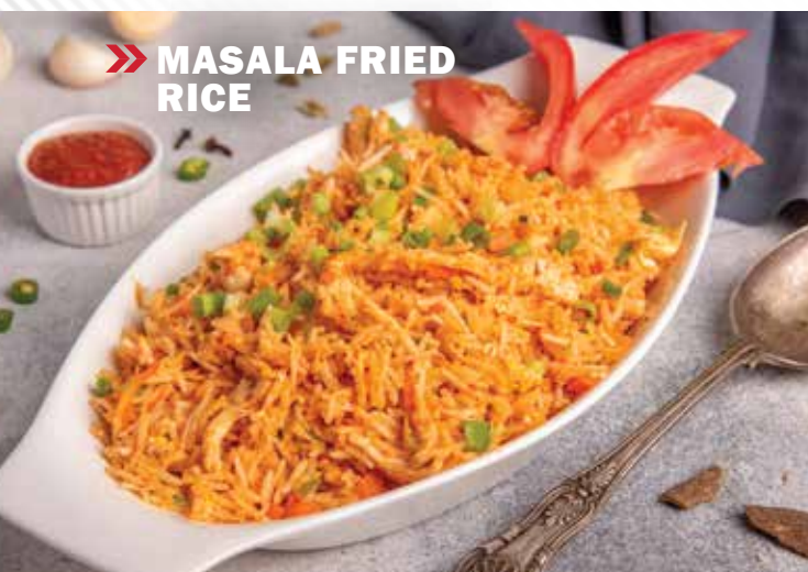
» MASALA FRIED RICE