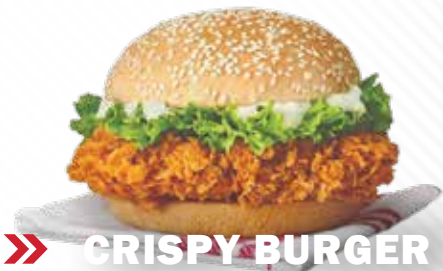
» CRISPY BURGER