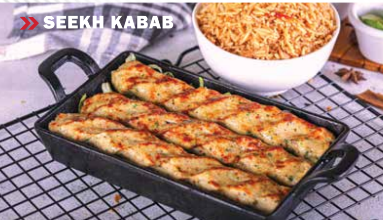
» SEEKH KABAB

Fajita Kabab 28 Pizza Kabab 28 ★ Cheesy Kabab 28