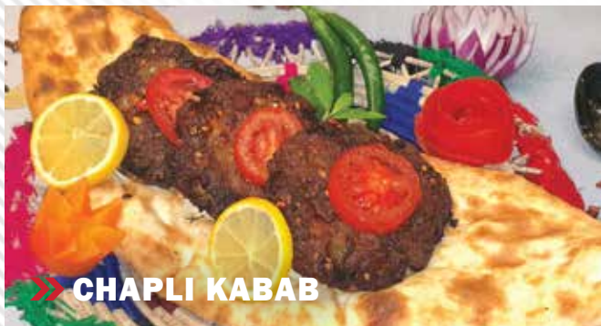
» CHAPLI KABAB

Chicken (3 pcs small) 28 Mutton (3 pcs small) 32 Beef 10 ★ Beef Special (Nalli & Egg) 15