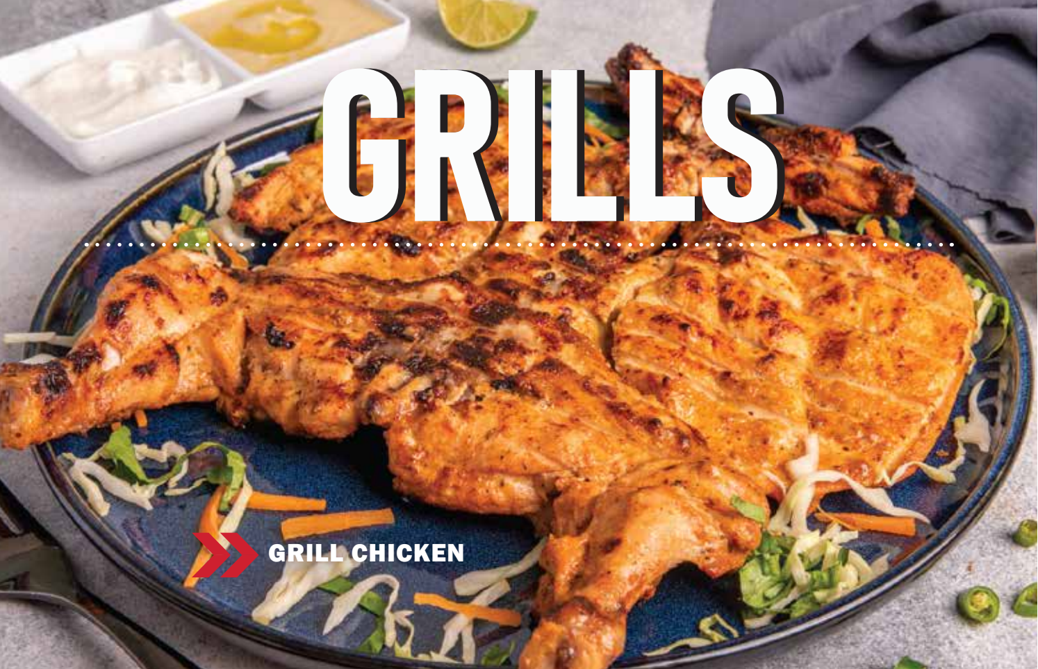
» GRILL CHICKEN