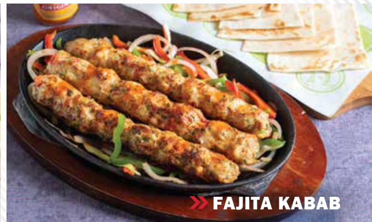
» FAJITA KABAB