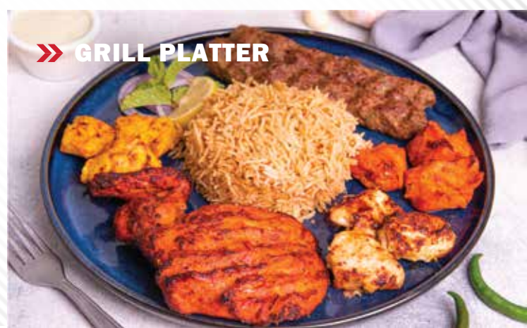
» GRILL PLATTER