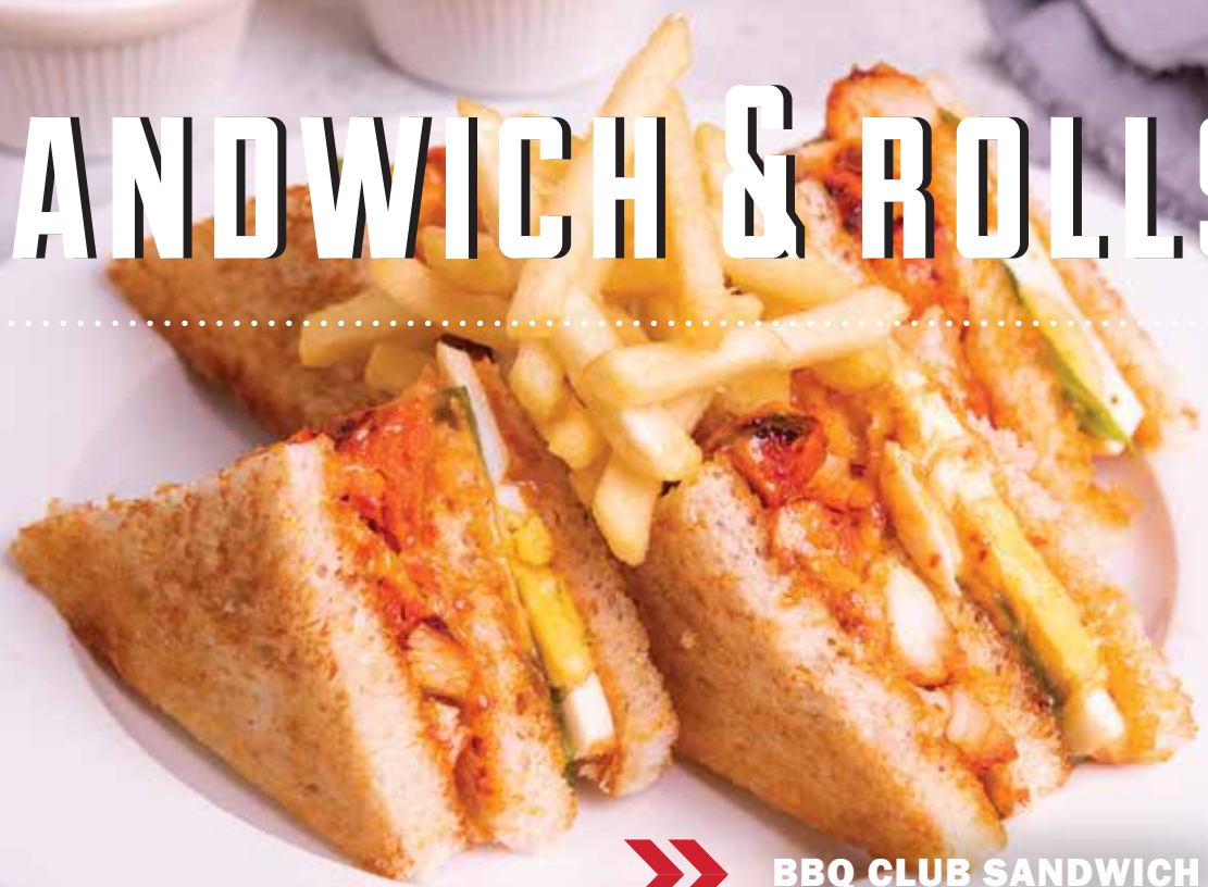
» BBQ CLUB SANDWICH